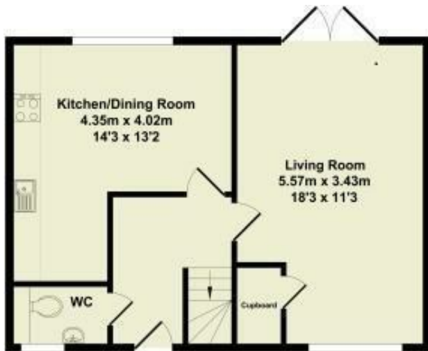
Ground Floor Approx. Floor Area 41.52 Sq.M. (447 Sq.Ft.)